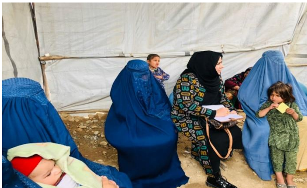
Counselling to Women