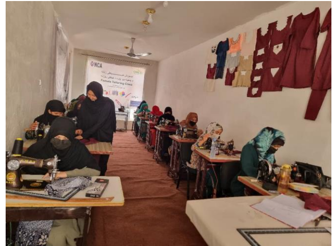
Women in sewing room