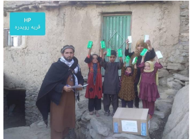
MNP powder distribution in roydar villag