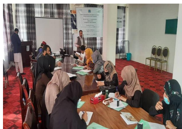
Figure 2 IMAM training