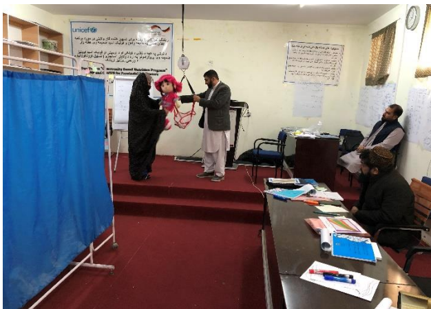
Under 5 Children examining

Picture during the CBNP ToT training for Master trainers