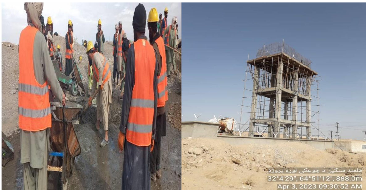
Figure 1 Solar Power Water Pipe Scheme, Helmand, ORCD

The project completed the selection locations/sites of 16 latrine in targeted health facilities and schools of 2 provinces (Helmand, and Nimruz ) from which 13 out of 16 latrines (12 construction and 1 rehabilitation) have been completed in close collaboration with the local authorities. The work of 13 latrines have been completed during project life in Helmand and Nimruz and handed over the local authorities.