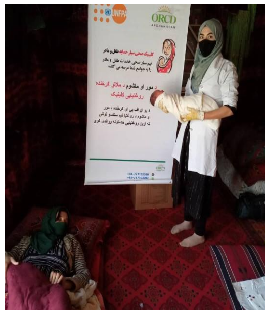
Badakhshan-Natal Service/ Delivery