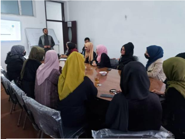
IMAM orientation for newly hired staff