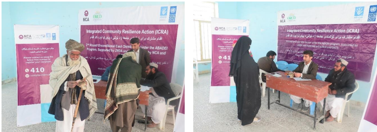
Figure 7 UCT Distribution Event, Helmand, ORCD