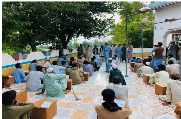
Hygiene kits distribution, Sept 21 ,2023