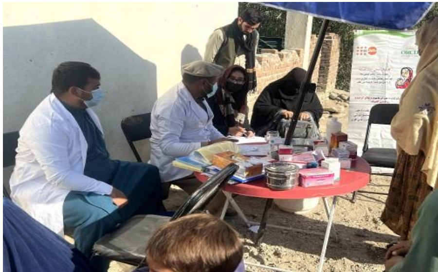
Laghman Nomads-Monitoring by RH Supervisor from KBL