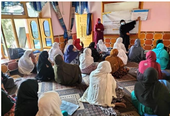
Cascade training, Narang, Aug 29,