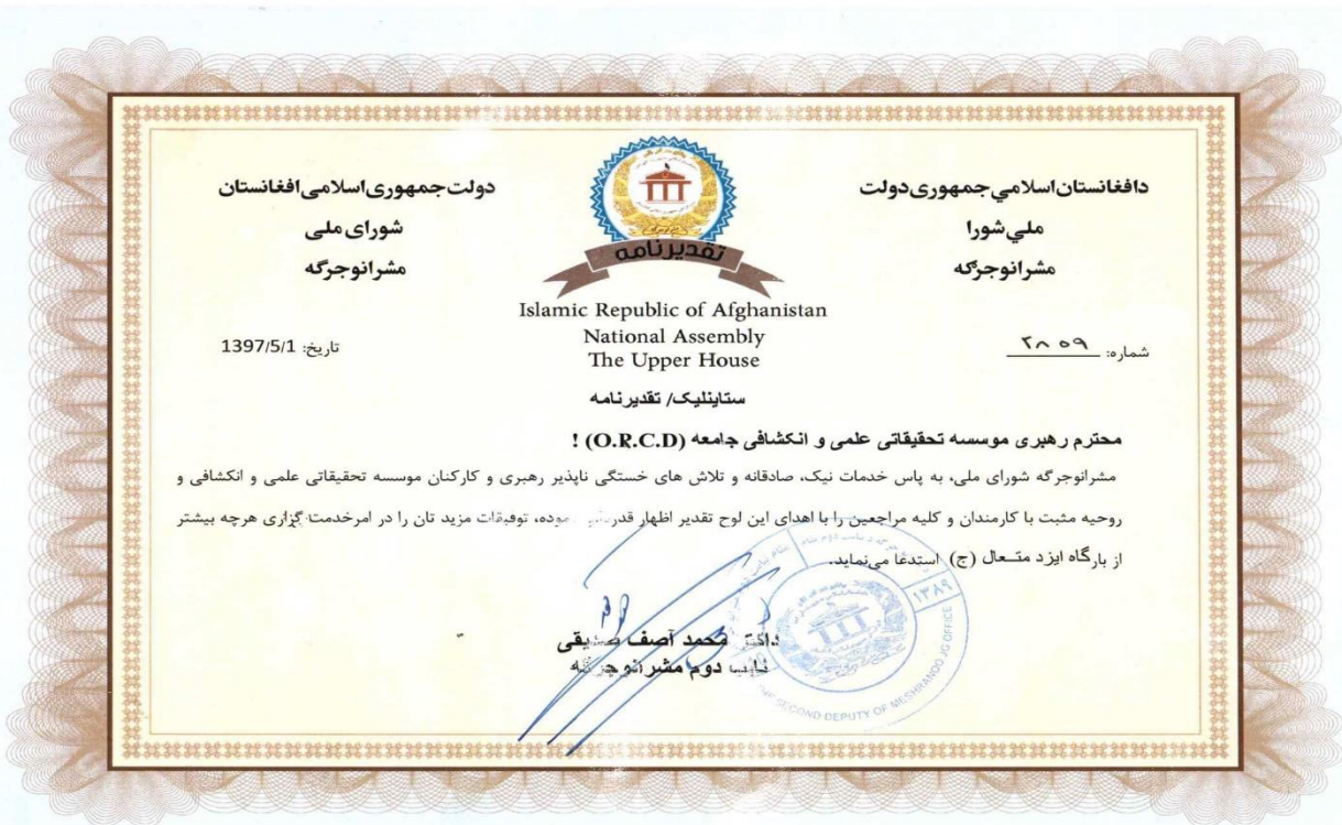
Upper House of the Parliament Appreciating ORCD's activities in Afghanistan