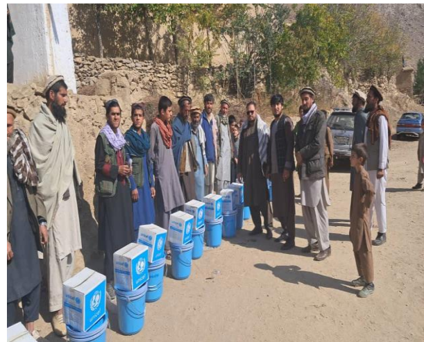
Hygiene Kit distribution