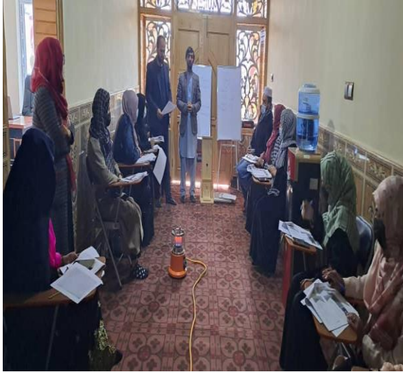
Orientation of Nutrition in Kapisa