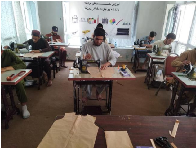
Men in sewing room

Under this project the selected beneficiaries received different type of trainings, Tools and technology and became enable to start a new business, manage their production and reached to sustainable employment. That has caused the communities toward economic empowerment.